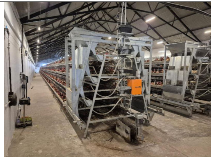
12. BATTERY CAGES