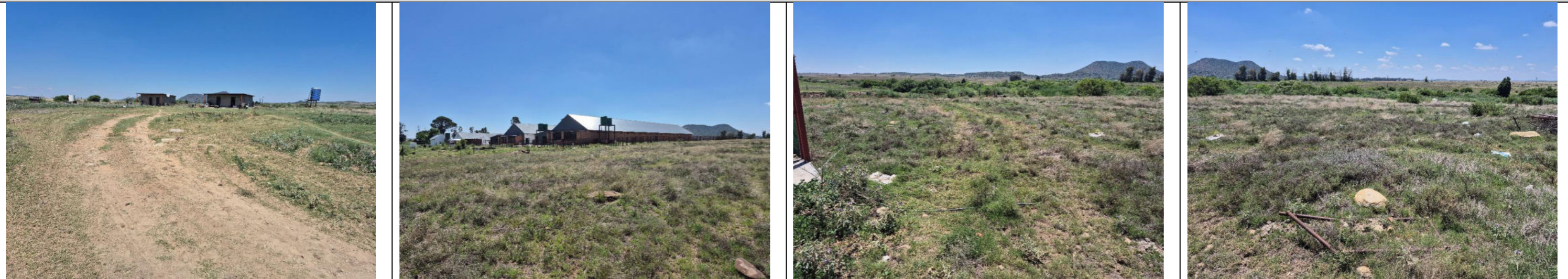
2. NEIGHBOURING FARM HOUSES: SOUTH-WESTERN VIEW