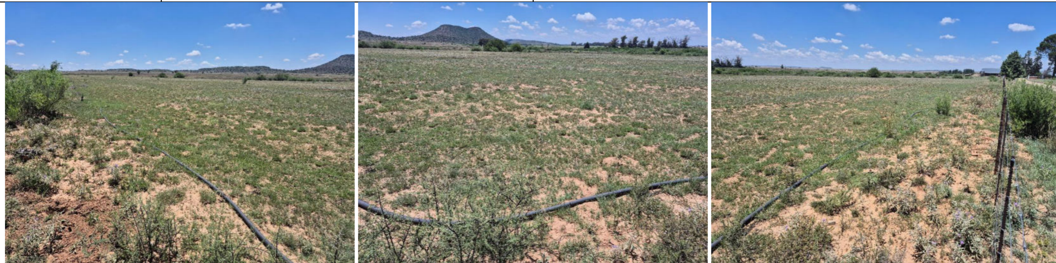
5. FIELD BORDERING THE LAYER FACILITY TO THE NORTH: NORTH-EASTERN VIEW