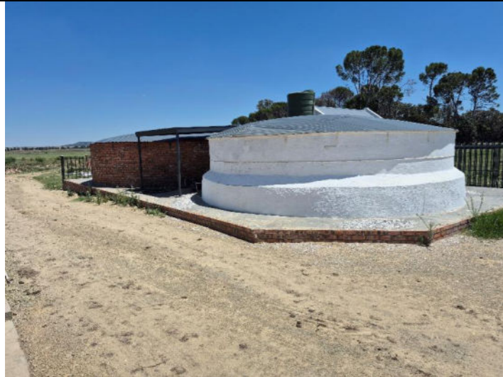
6. CONCRETE DAMS IN THE NORTH-WESTERN CORNER OF THE PROPERTY