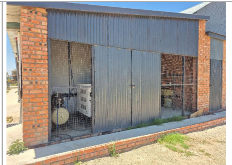
14. GENERATOR ROOM